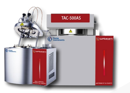
Ambient to 400°C, 500°C