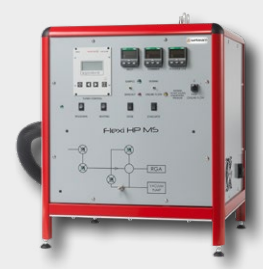
FLEXI HP MS Evolved gas