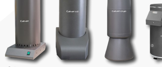
Ambient to 200°C, 300°C, 600°C / -196°C to 200°C