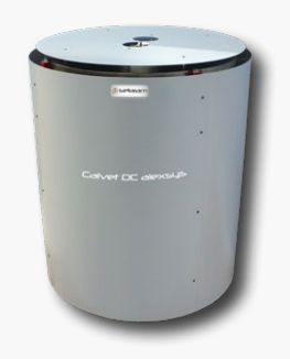
500°C to 1000°C